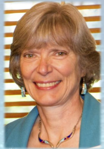
Dr. Terry L Root